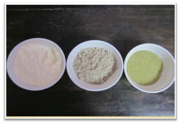
Feg.2 Powder form of coagulant

Its flower should be completely dry on the tree. After dry it must be in white colour.Good qualityprocera flower collected from khedregion, Pune.Then it into powder form by used manually.