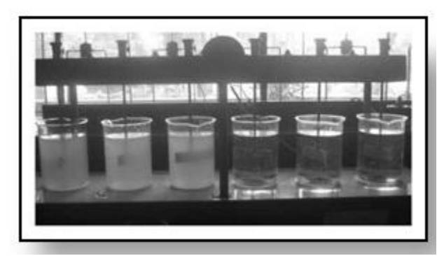
Feg.3 Jar test

of coagulant like moleifera, dolichos lablab, cicer aeietinum, calotropis procera. Whole process should be conduct with different speed.